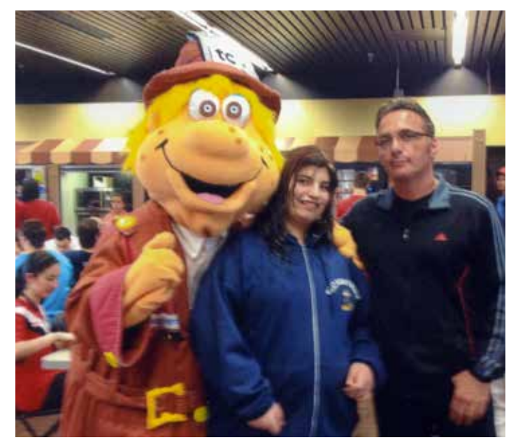
PO1 Laval, QC